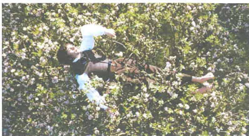
(from Bright Star )