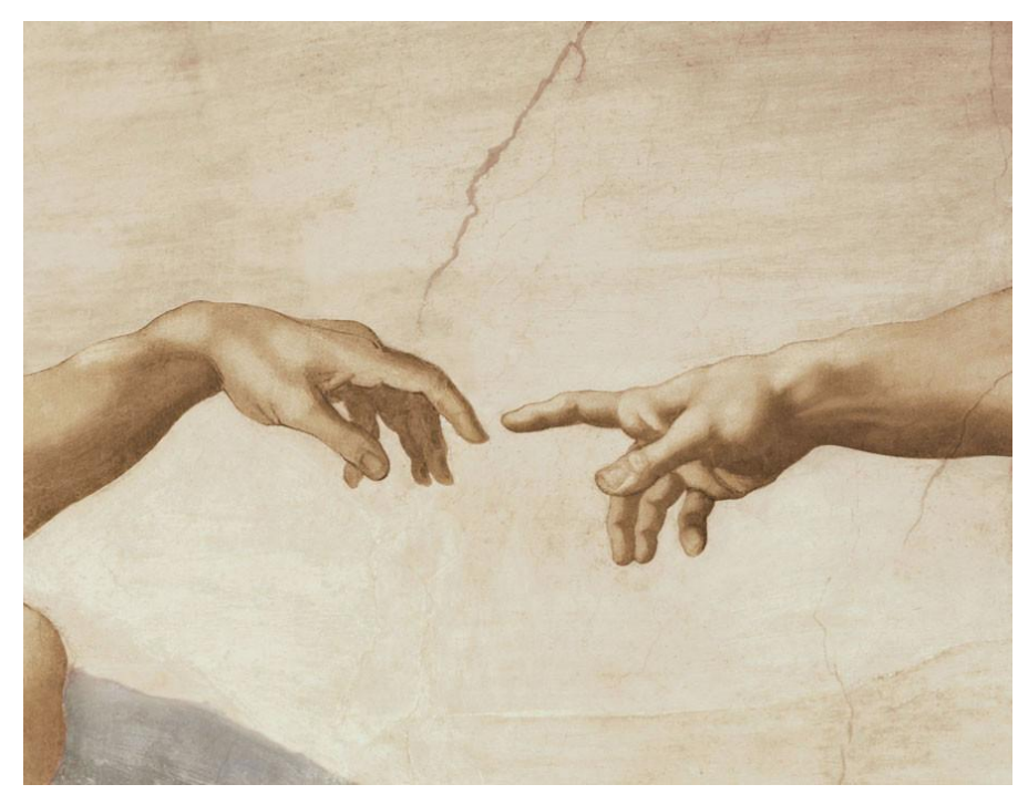
Adam and God' by MICHELANGELO (Sistine Chapel, Vatican City)